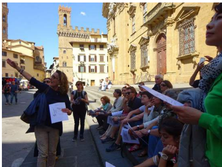
Italian language students out in Florence on a guided walk

Prices may need to be updated in 2025, for the above courses