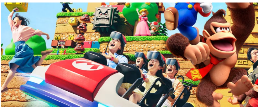
Universal Studios, Osaka