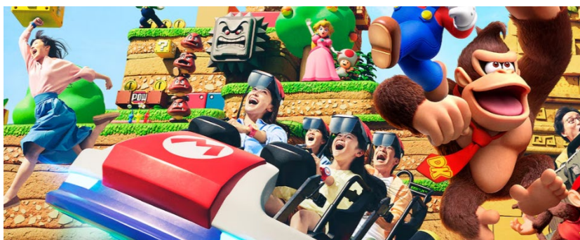
Universal Studios, Osaka